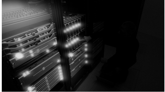
IR light reflects from object, reducing visibility.

Prevent excessive illumination on objects that are in the front of the scene while offering a clear B/W image without loss of detail.