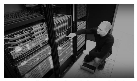
Smart IR™ distribute the IR light evenly in the FoV.