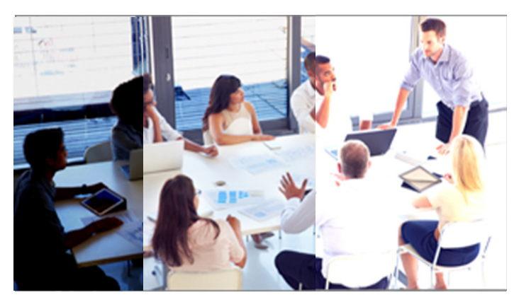
Details are visible in over and under exposed areas.

Cameras with true WDR technology have advanced sensors that can deliver clear images in a wider range of lighting.