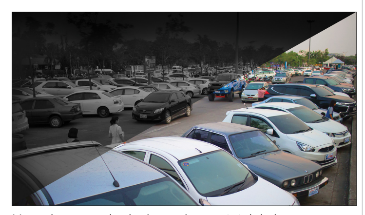
Monochrome and color image in near-total darkness.

Cameras equipped with a Star-Light Plus™ sensor provide crisp, clear B/W and color images even in near complete darkness.